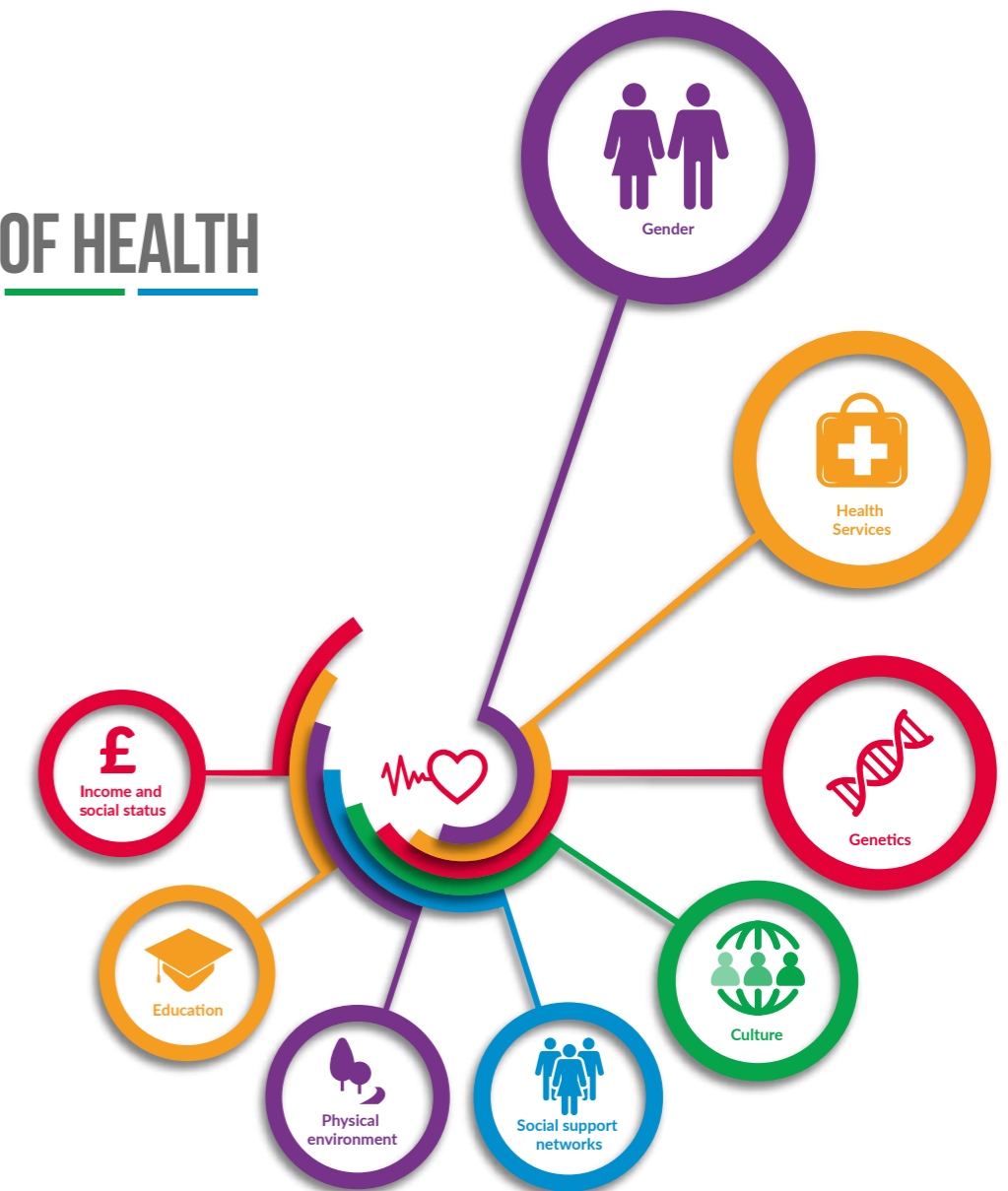
Figure 6.1: Determinants of Health

6.7 Many factors combine to affect the health and wellbeing of individuals and communities. To a large extent, factors such as where we live, the state of our environment, genetics, our income and education level, and our relationships with friends and family all have considerable impacts on health, whereas the more commonly considered factors such as access and use of health care services often have less of an impact.