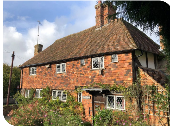
Kentish vernacular - timber framing, local red brick, tile-hanging, peg tiles on the roof and leaded casement windows

When selecting materials for new development or alterations to existing buildings, consider the following guidance. A range of detailed advice notes has been produced by the Society for the Protection of Ancient Buildings and can be found on their website.