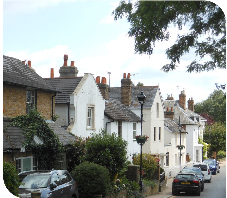
Chimneys make a strong contribution to the character of roofscapes and skylines