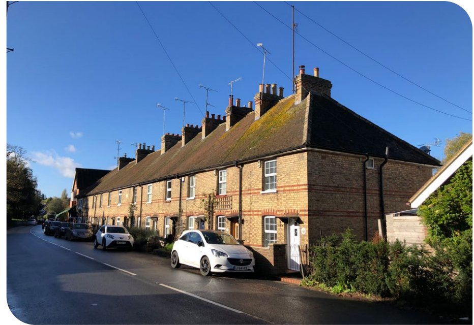
A terrace, note the rhythm of windows and chimney stacks and the continuous roofline