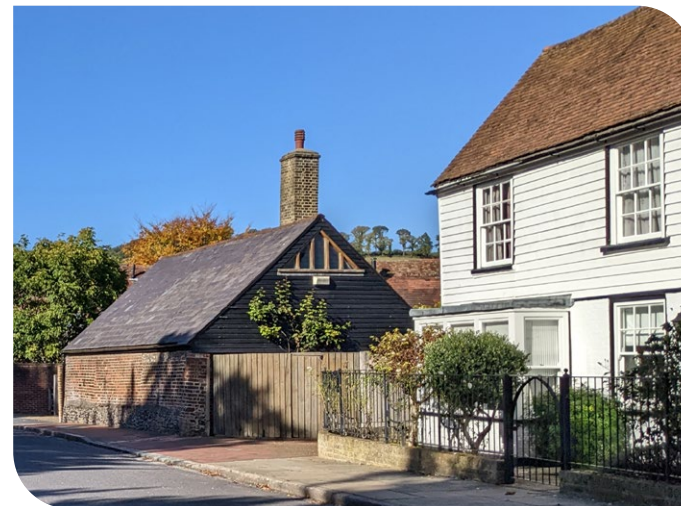
Weatherboarding is sometimes used to clad houses, and usually then painted a pale shade; more often it is employed to clad ancillary or farm buildings, when it is traditionally tarred black if softwood is used