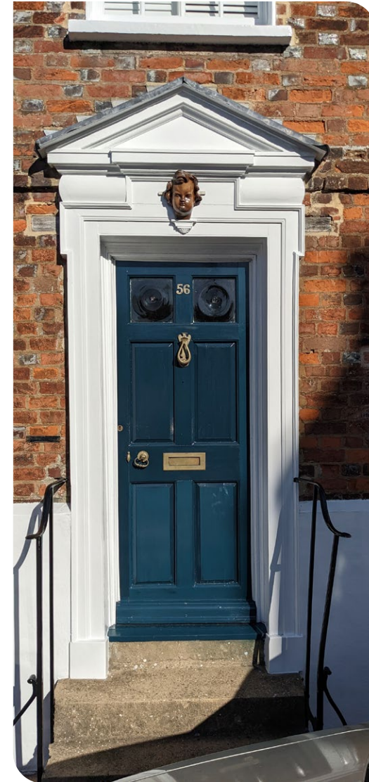
Classical Georgian door and doorcase