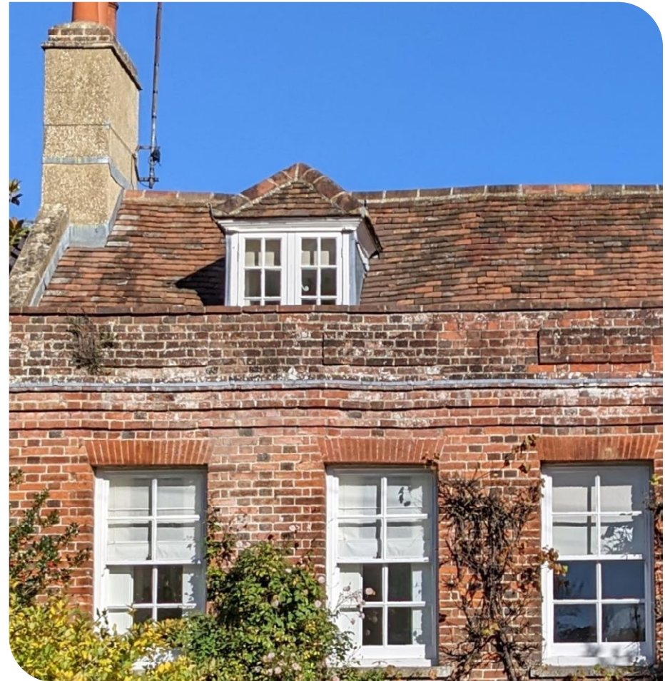
Kentish 'peg tiles', irregular roof line and dormer window. Traditionally, where they are used, dormer windows are small and visually subservient