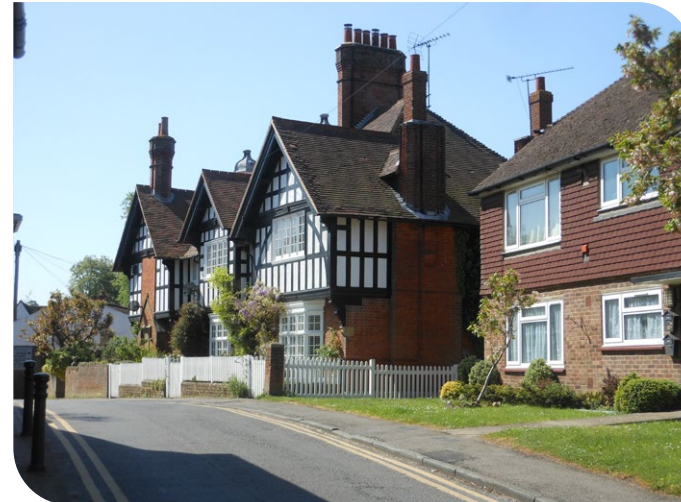
'Vernacular Revival'. Note the materials, white painted timber windows and the lively roofline