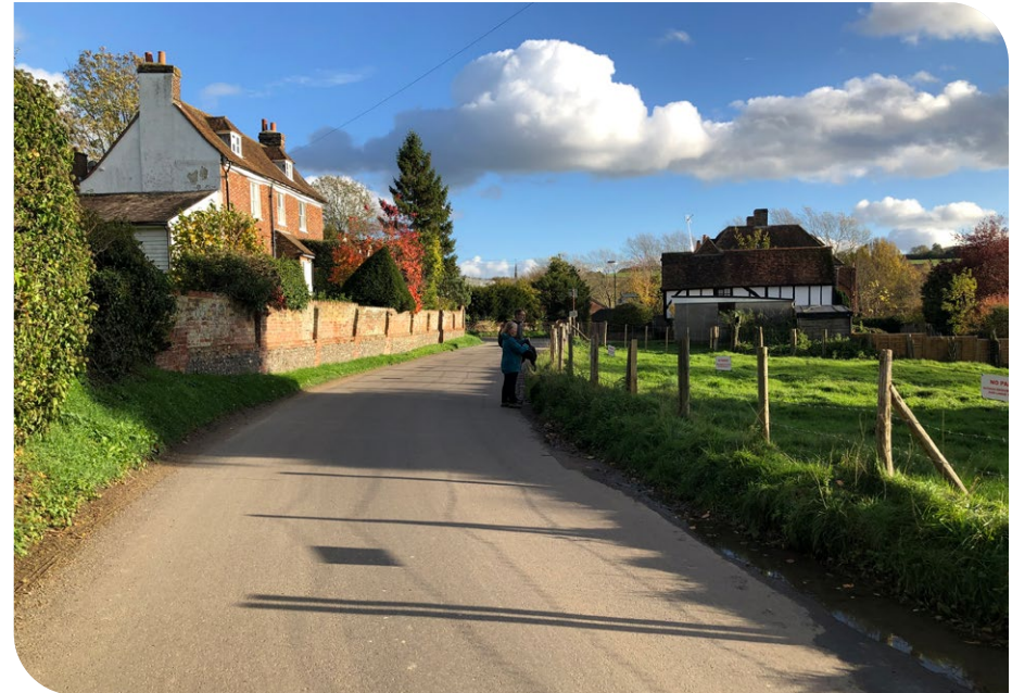
Any proposal for an extension or new building need to consider how it will be viewed from streets, public rights of way and across open space