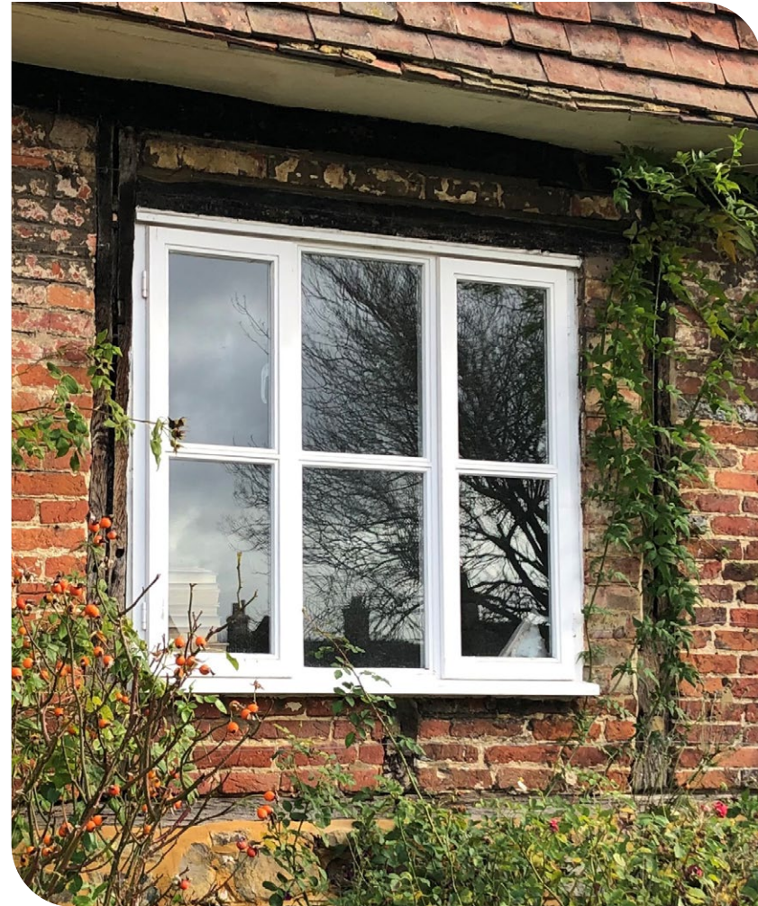
Softwood timber casement window