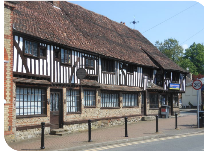
The District has a tradition of buildings made of oak frames, with painted plaster panels