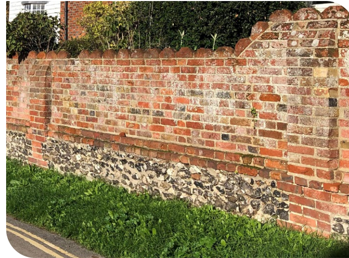
Boundary wall of handmade brick, with knapped flint base and decorative copers