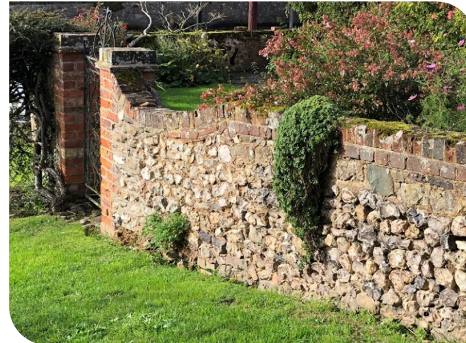
Knapped flint wall with brick detail and a wrought-iron gate