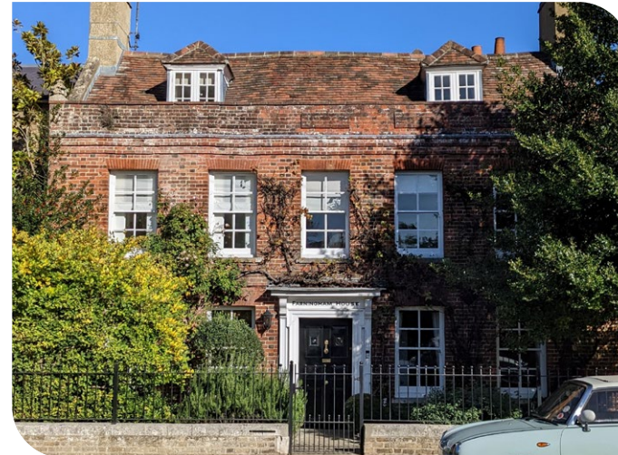
Handmade brick, with flush lime pointing