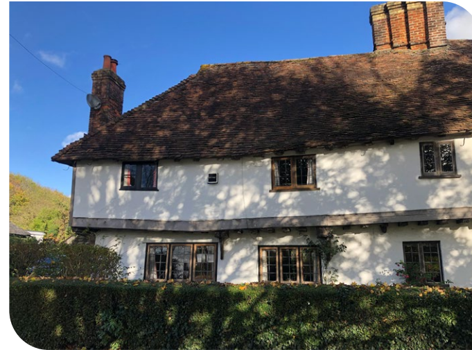
Lime render has been applied to buildings for centuries, in this case to a timber-framed house