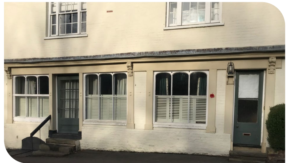
Historic shopfront, carefully retained