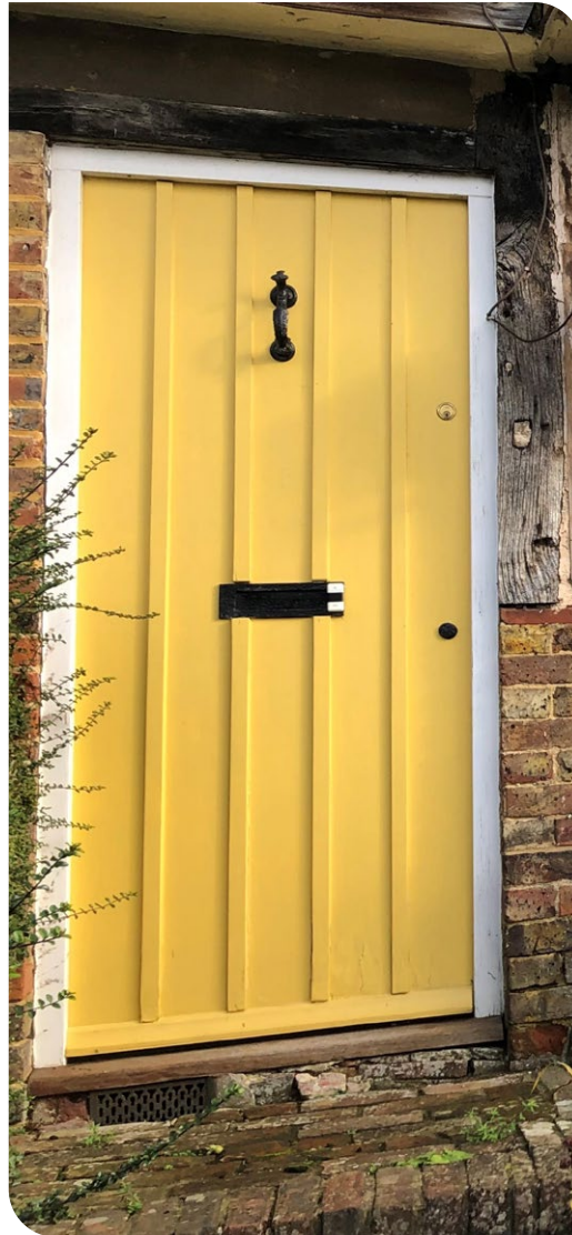
Traditional vernacular planked door